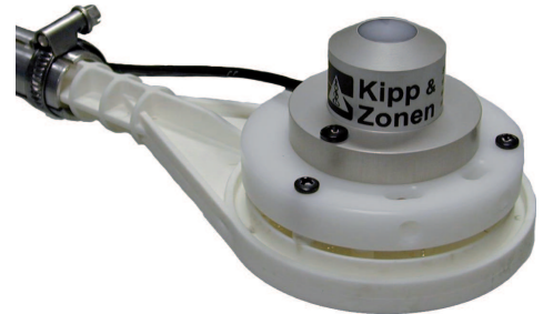
Pyranometer SP-Lite with mast mounting arm and amplifier